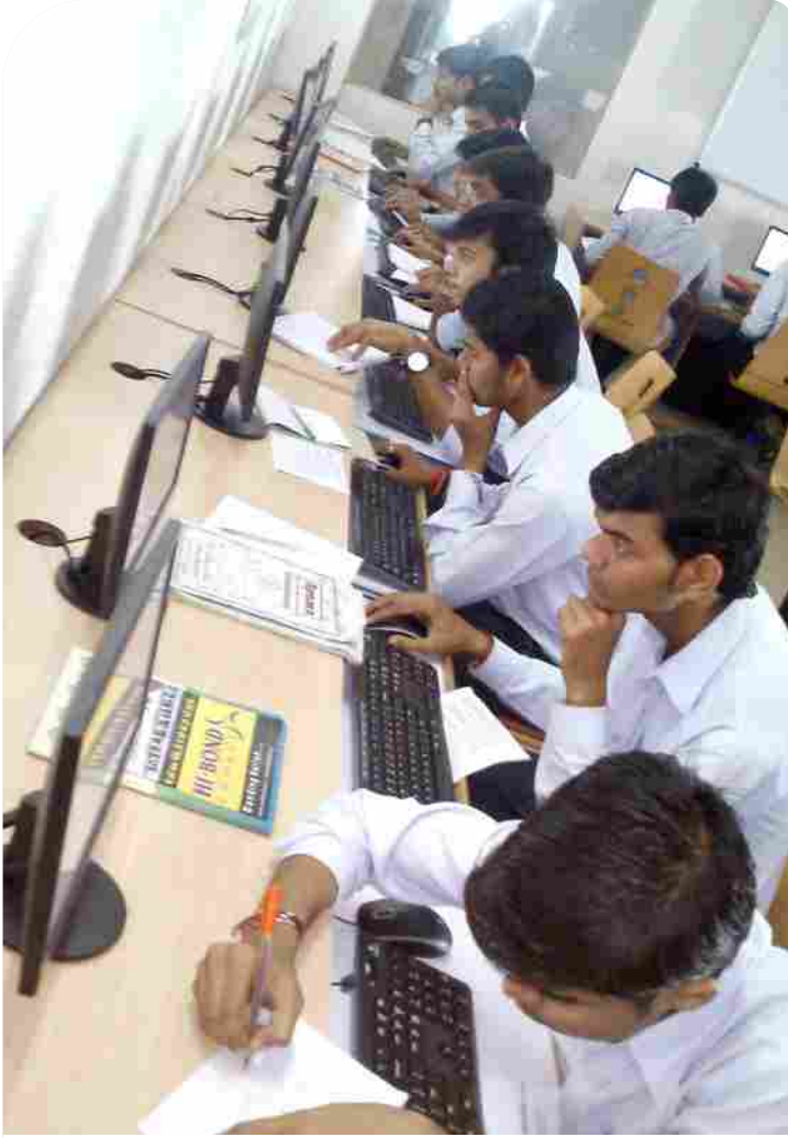
Participants struggling for solution