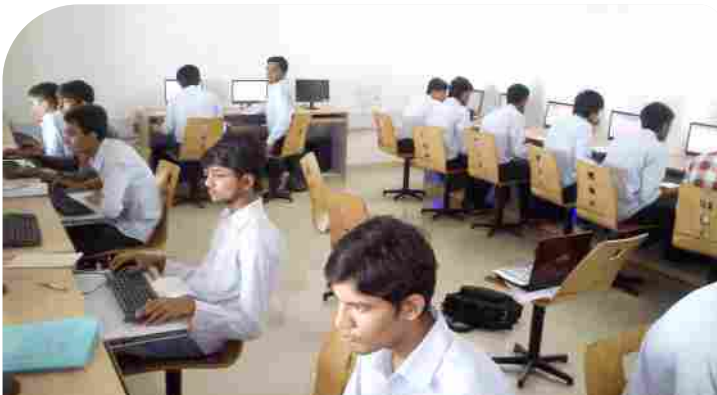
Participants in action

The students provided different solutions for the given problem.